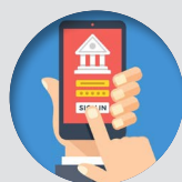
Mobile Banking App

You can access and respond to your bank's DebiCheck request by accessing your preferred banking channel.